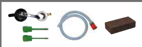
starter kit: centering device with drilling template, water suction hose with Gardena-Connector, diamond wet full drill bits 6/8 mm, sharpening block